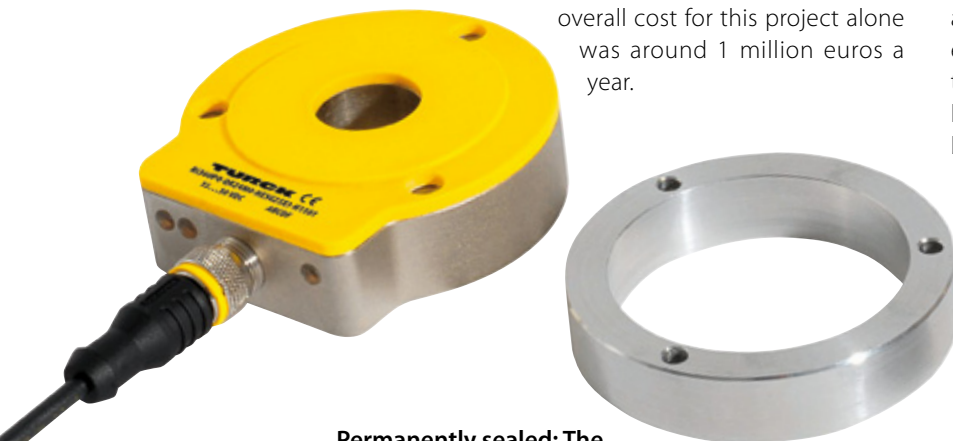
Permanently sealed: The sensor element (left) and the positioning element (right) are fully encapsulated so that water cannot penetrate

The maintenance-free RI encoder will provide great cost savings. Around 20,000 optical encoders are installed in the power station. The operators had to replace around a third each year due to faults or impending failures. At a unit price of 100 euros, this meant replacement costs of around 700,000 euros a year. Added to this are the costs for service technicians and the loss of power generation. The overall cost for this project alone was around 1 million euros a year.