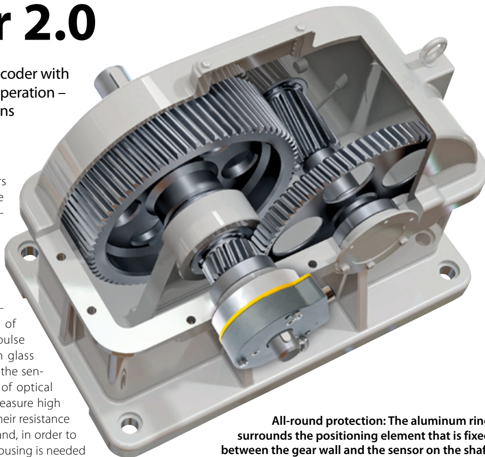
All-round protection: The aluminum ring surrounds the positioning element that is fixed between the gear wall and the sensor on the shaft

The seal of the encoder housing is often the central weakness. Eventually it becomes brittle, cracked and then leaks and can crack due to the permanent load caused by the rotating shafts. Penetrating water or dirt damage to the sensitive sensor circuit can cause failure. Optical and potentiometric encoders only comply with high degrees of protection under optimal conditions.